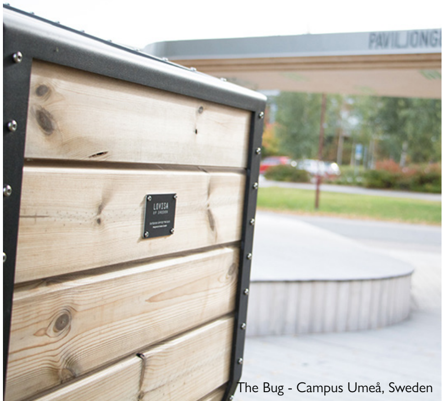
The Bug - Campus Umeå, Sweden